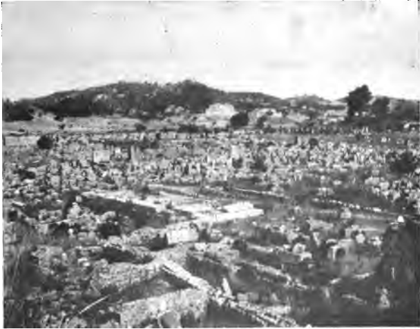
Fig. 6. View of ruins at Olympia.

the lyre or flute when the victors returned to their own cities in triumphal state. Moreover, the greatest sculptors joined to do them honor; for the proudest glory of an Olympic victor was the right he gained of having his statue set up in the precinct of the god. As one walks now through the ruins at Olympia, here he can make out the plan of the palestra in whose wide spaces Greek youth wrestled, ran races, rivaled one another in throwing the discus. Here was the long colonnade or stoa beneath whose shade poets read their works; in front, long rows of statues of youths, nude as they appeared when winning their